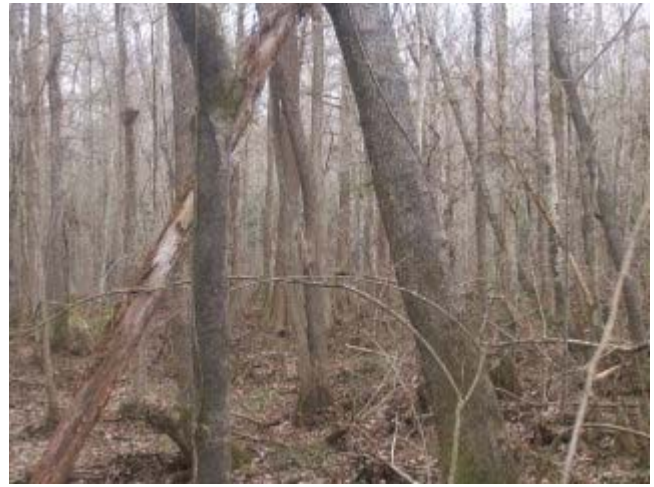
Additional View 2