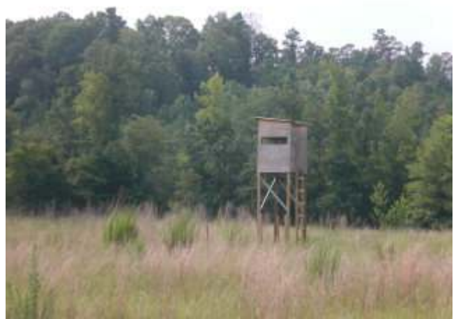
Additional Inside 3