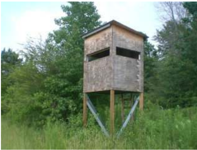
Additional View 4