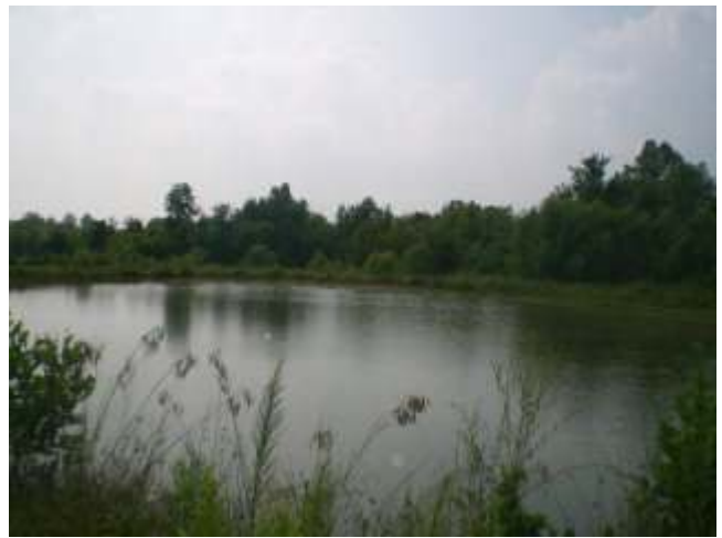
Additional Inside 1