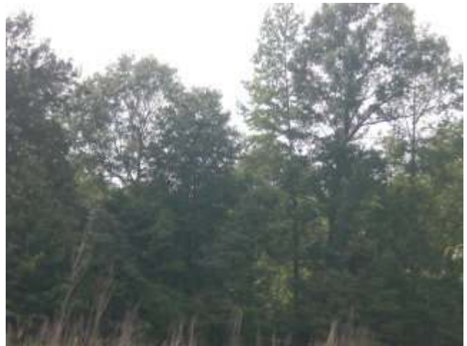
Additional View 6