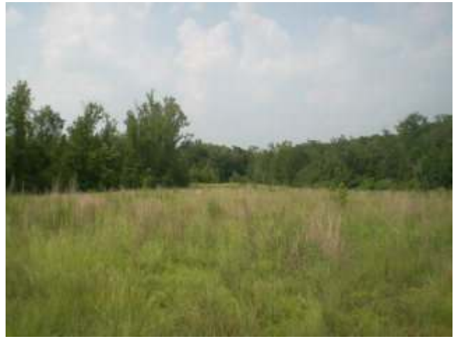
Additional View 3