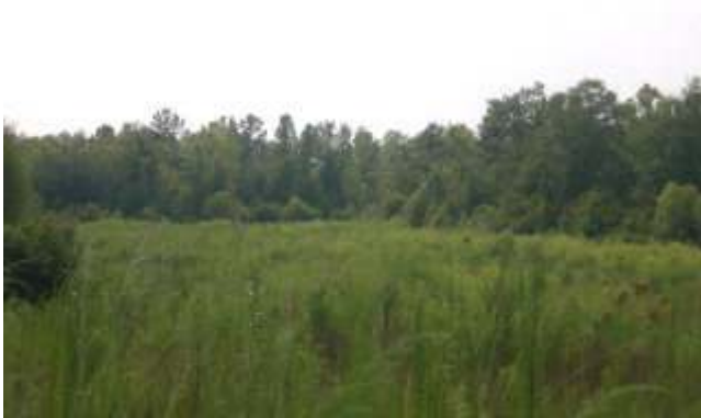
Additional Inside 2