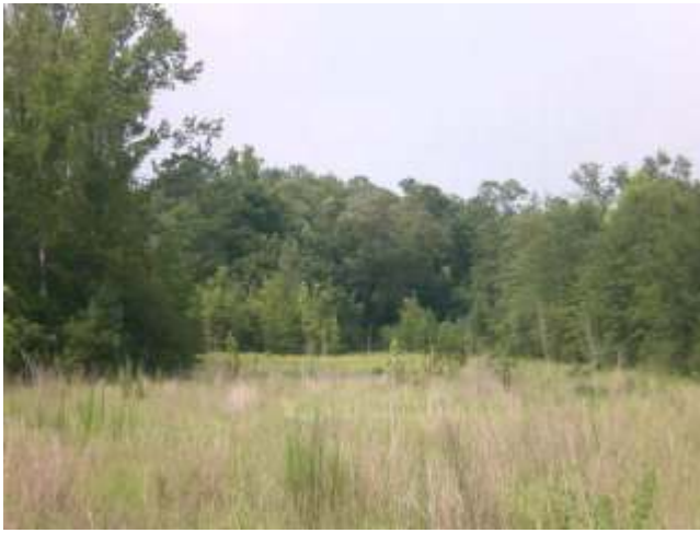
Additional View 2