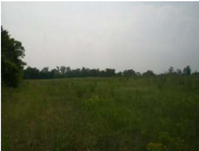
Additional View 5