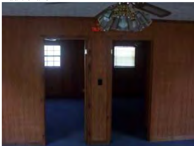
Additional Inside 2