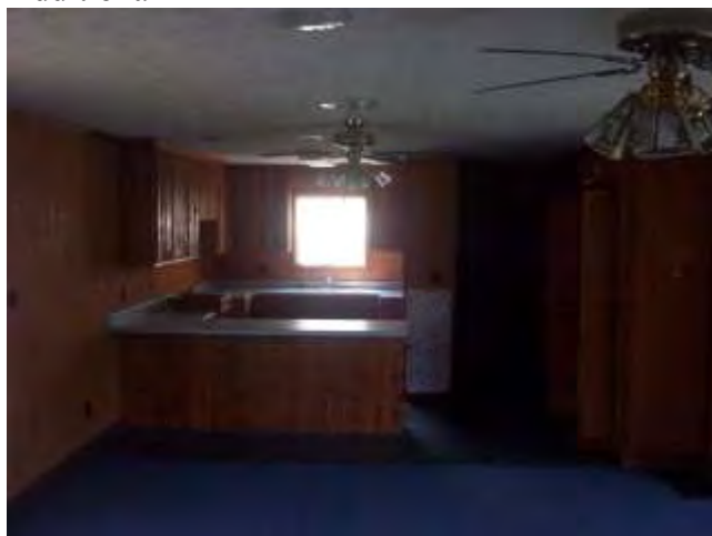
Additional Inside 1