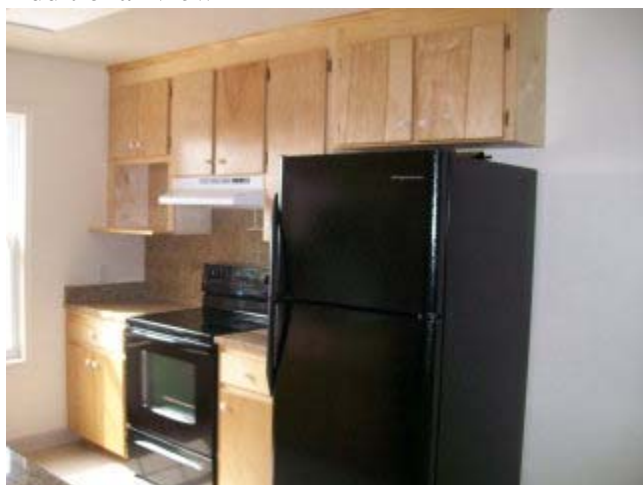
Additional View 4