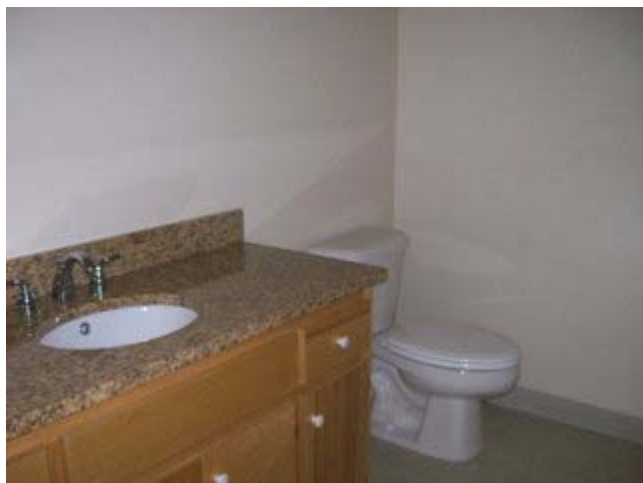
Additional View 2