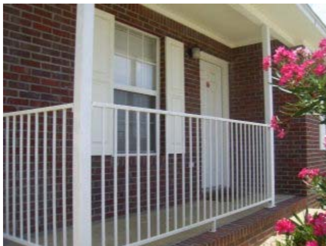
Additional View 3